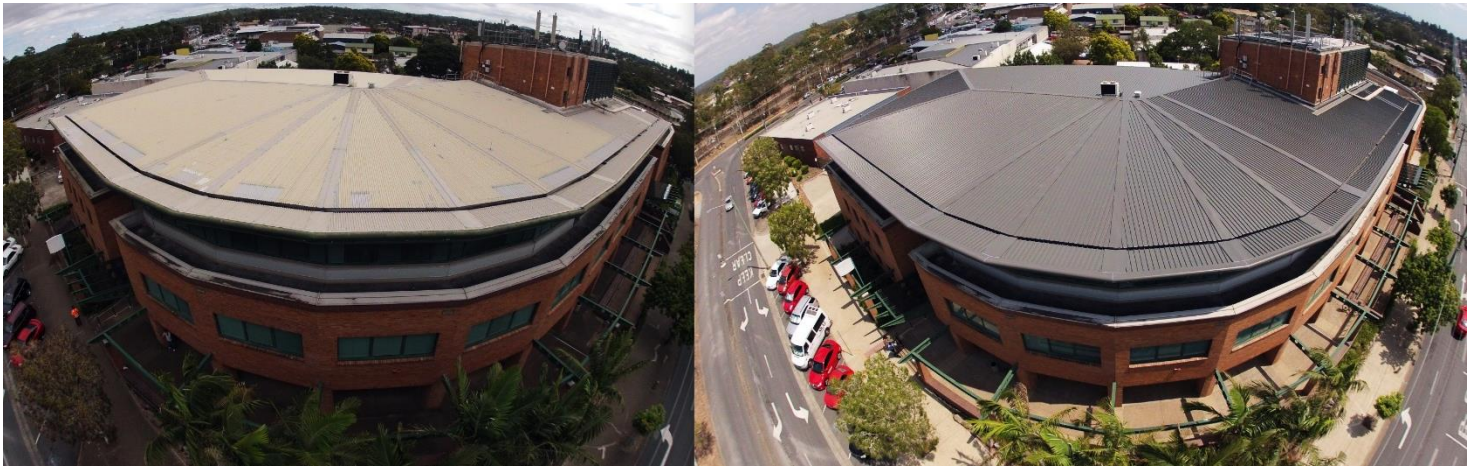
Old Metal to COLORBOND® Steel Roof Replacement Ewing Road, Woodridge Qld 4114