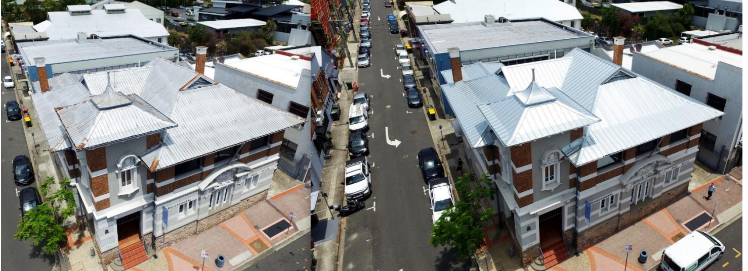
Heritage Listed Galvanised Steel Roof Replacement Old Woolloongabba Post Office; Stanley Street, Woolloongabba Qld 4102