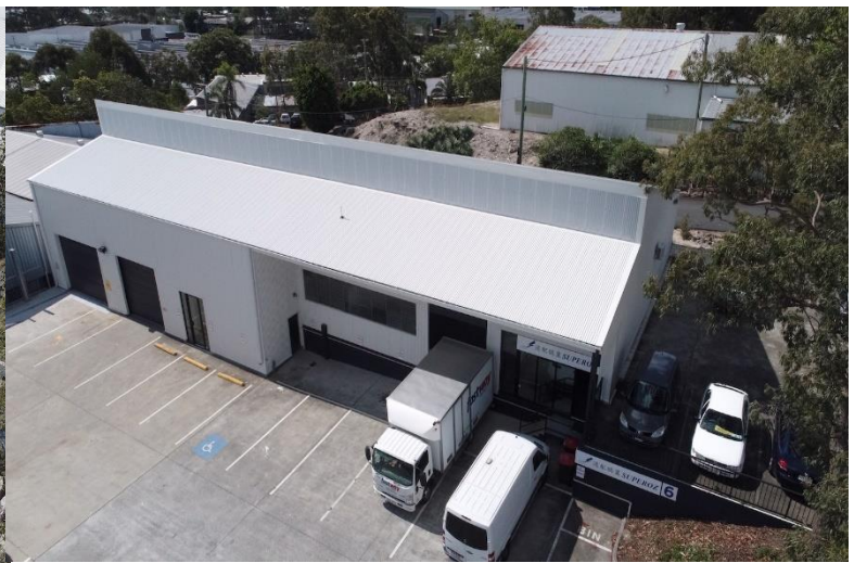
Asbestos to COLORBOND® Steel Roof & Wall Cladding Replacement Sheds 5 & 6, 210 Evans Road, Salisbury QLD 4107