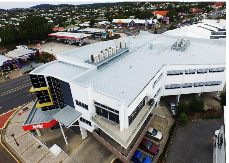
Old Metal to ZINCALUME® Steel Roof Replacement and Air Conditioning Repositioning 485 Ipswich Road, Annerley Qld 4103