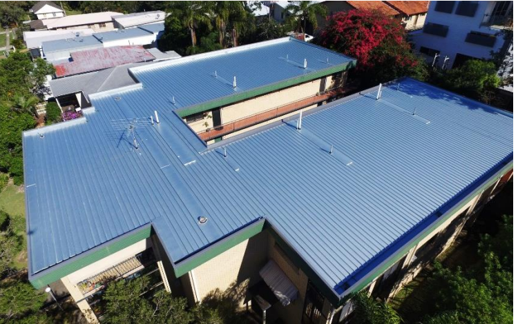
Rusted Metal to ZINCALUME® Steel Roof Replacement Wickham Street, Morningside Qld 4170