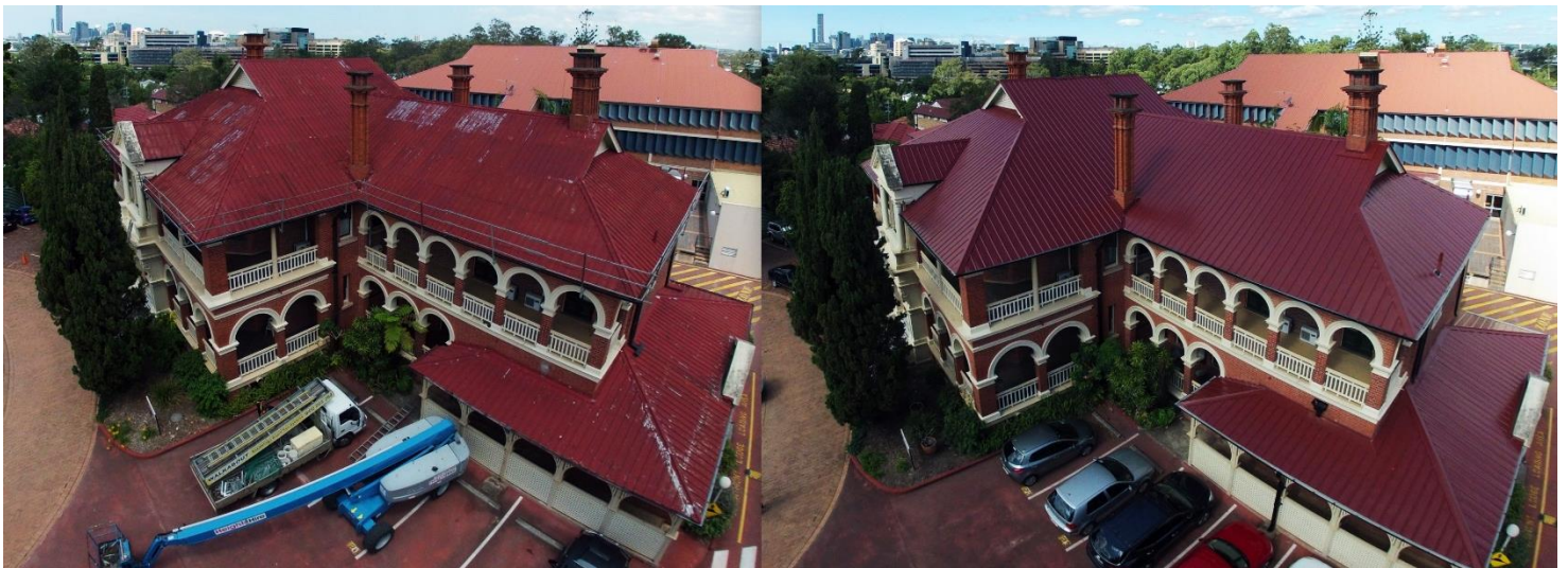
Heritage Listed COLORBOND® Steel Roof Replacement Uniting Church in Australia; Bayliss Street, Auchenflower Qld 4066