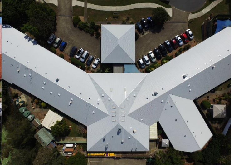
Terracotta Tiles to COLORBOND® Steel Roof Replacement Estia Health – Faheys Road West, Albany Creek Qld 4035